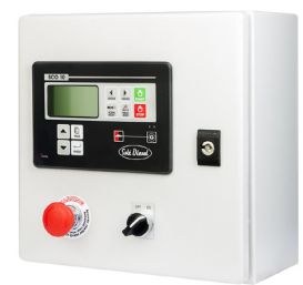
IP 65 Box Kit