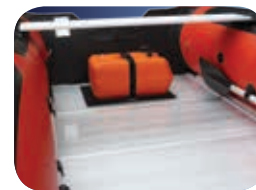
Fuel tank not included

Includes: Collapsible oars, repair kit, foot pump, oversized valise Tube Pressures - Max: 0.25 bar / Mattress: 0.6 bar